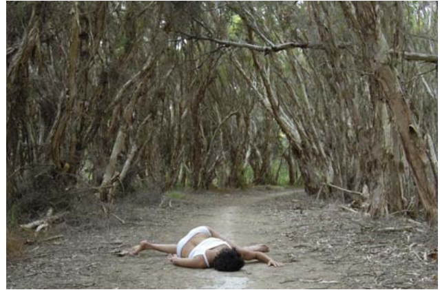
Rites , (currently in development)