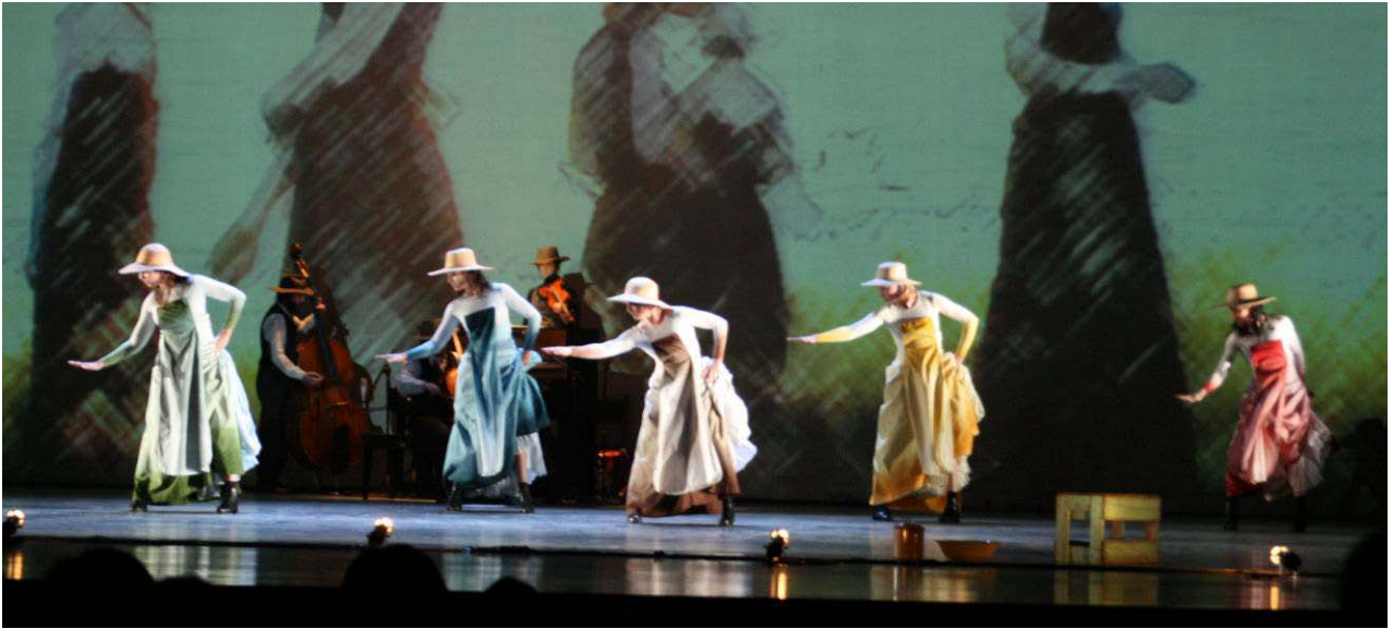
MEDEA, 2005, Image by Jon Green