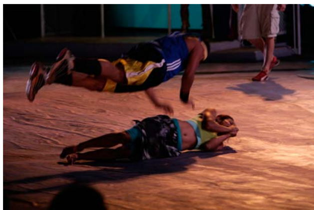
Burning Daylight (2007) Zurich, Switzerland, 2007