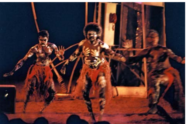
Crying Baby (2004)