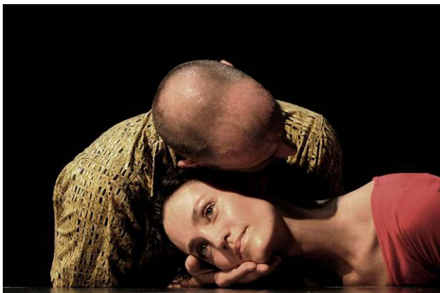
Questions Without Notice, 2009 Images by Christophe Cantato