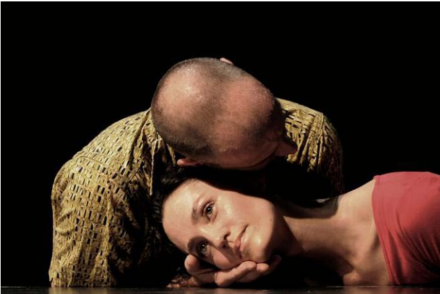
Questions Without Notice, 2009